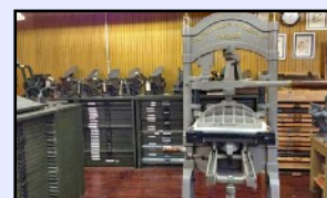
Museum of Printing History

Please meet at 9:00 am Woodhaven Baptist Deaf Church 9920 Long Point Rd, Houston