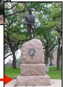
Victoria County Confederate Monument