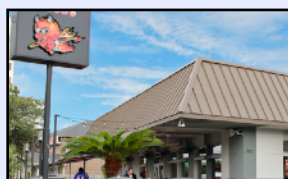
Torchy's Tacos (on your own)