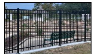
Memorial Rose Garden