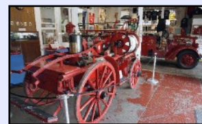
Houston Fire Museum